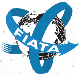
International Federation of Freight Forwards Association (FIATA)