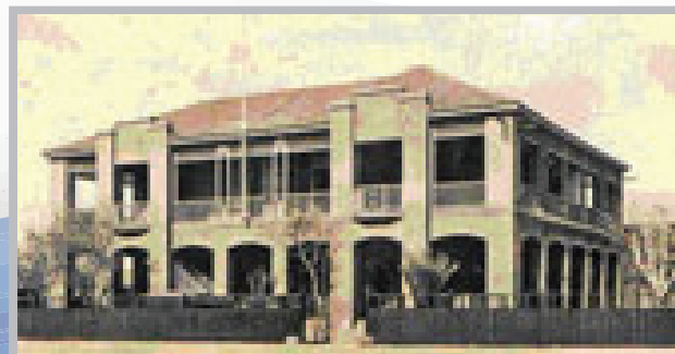
Eastern Telegraph Company, Port Sudan