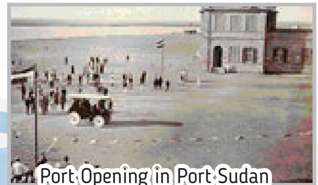
Port Opening in Port Sudan